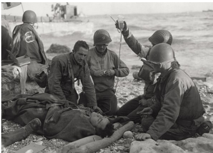
Medics give a blood transfusion to a victim on D-Day.