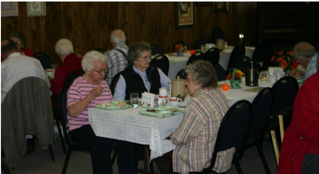
Senior Meal Site article on page 1