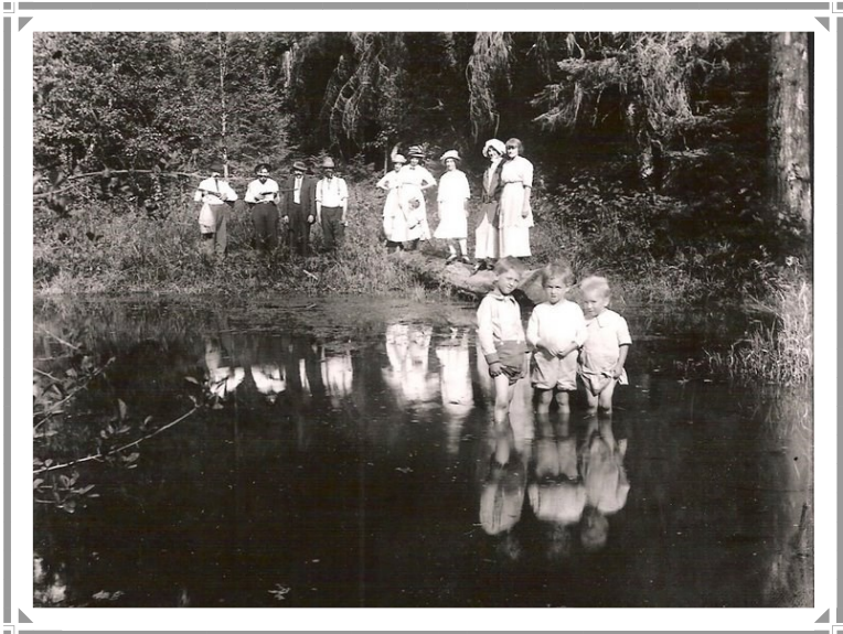
Atwater Lake circa 1915