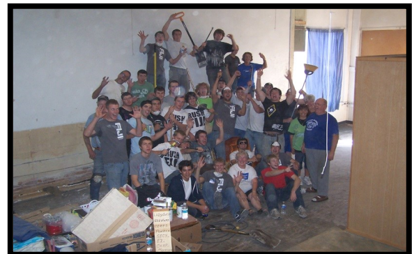
Still Smiling at the End of the Day