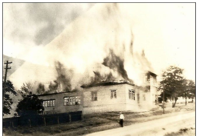
School house burning May 31, 1931