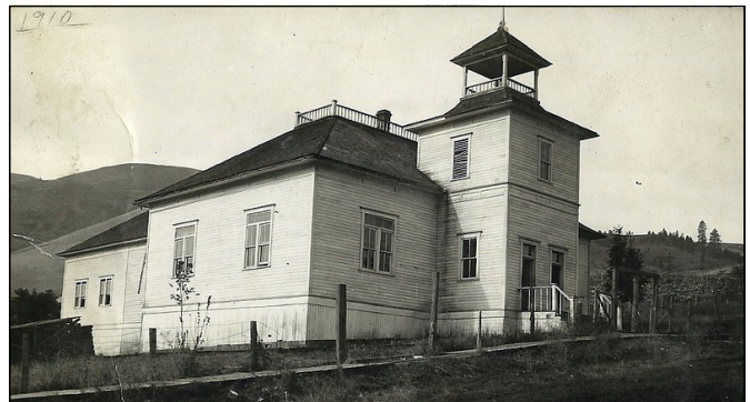
Juliaetta School 1910